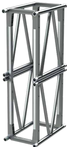
XL101 Vertical Stacked