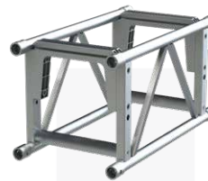
60 mm Tube