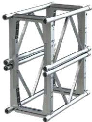
L52 Vertical Stacked