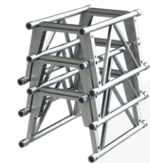
Stacked L52 Truss