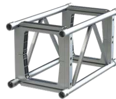
L52 Double Truss